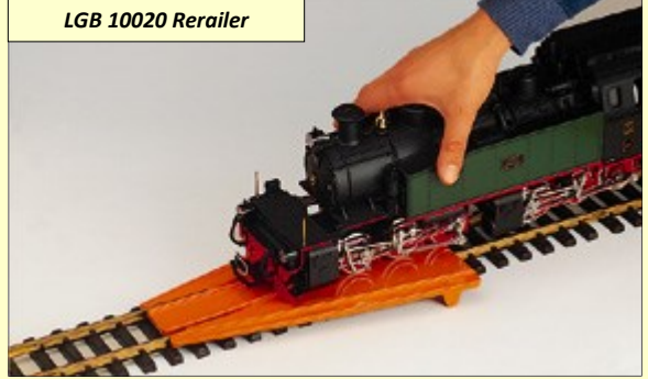
LGB 10020 Rerailer

My Large Scale Rerailer (Loading Ramp) was designed in Fusion 360, my CAD (Computer Aided Design) program, and 3D printed on my Bamboo Lab X-1 Carbon in two sections.