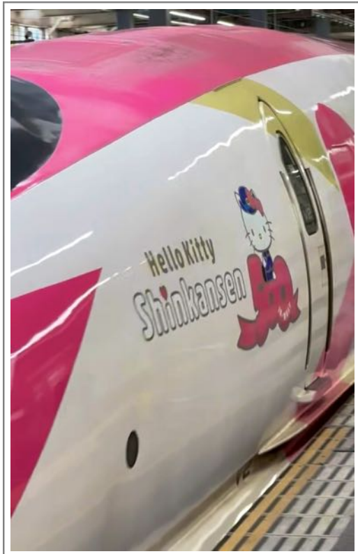
From Pete Lammer after reading last month's DGRS Newsletter

Newsletter: publications@denvergardenrailway.org